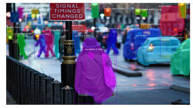
Fig B. Application Of Mask R-CNN for self driving cars.

There are the results of Instance Segmentation on real time object detection of Self Driving cars using Mask R-CNN.