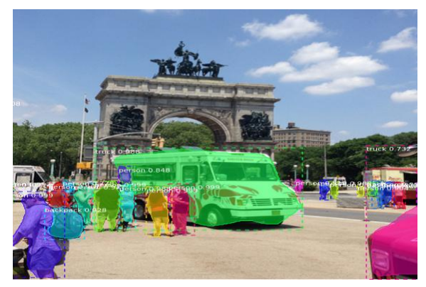
Fig D. Detection of objects using Mask R-CNN