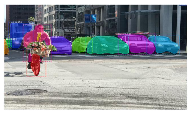
Fig C. Instance segmentation with Mask R-CNN.