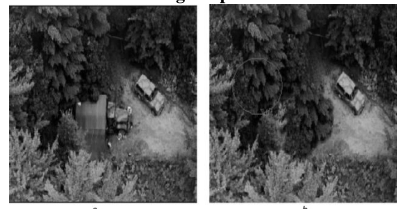
b Forged picture 1