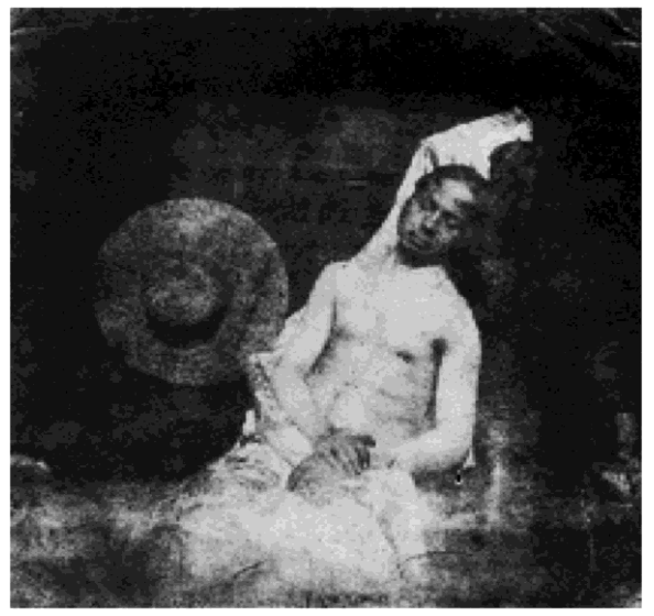
Fig. 1 : First phony picture

Picture fraud can be mapped back to as in all respects right on time as the 1840s when Hippolyte Bayard created the amazingly first fake picture, in which he was uncovered devoting an implosion. In 1860s an extra fake picture appeared in which the head of Abraham Lincoln (the after that United States Head Of State) was fixed over the body of a resistance political pioneer, Numerous different conditions may be situated out of sight of the length stretching out over the late nineteenth century and furthermore the in all respects mid twentieth century. With the entry of the Hollywood variable, development films with incorporated scenes have really wound up being a standard. Distinctive altered fight photographs after that appeared and furthermore utilizing such pictures was pondered part compelling fight exposure,