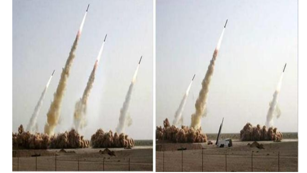
Figure 5. Re-tested picture: Iran armed force's Missile

to overemphasize their military durability by just uncovering 4 shot rather than 3 in the underlying picture.